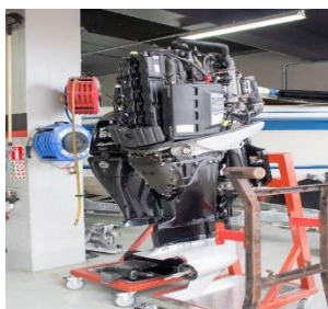
Powerboat rigging and Servicing