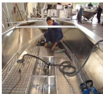
Alloy Boat Building

The New Zealand Marine Industry needs skilled apprentices to support growth and to drive innovation in the industry, involving designing, manufacturing, building and selling a range of vessels and marine equipment.