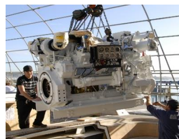
Marine Systems Engineering