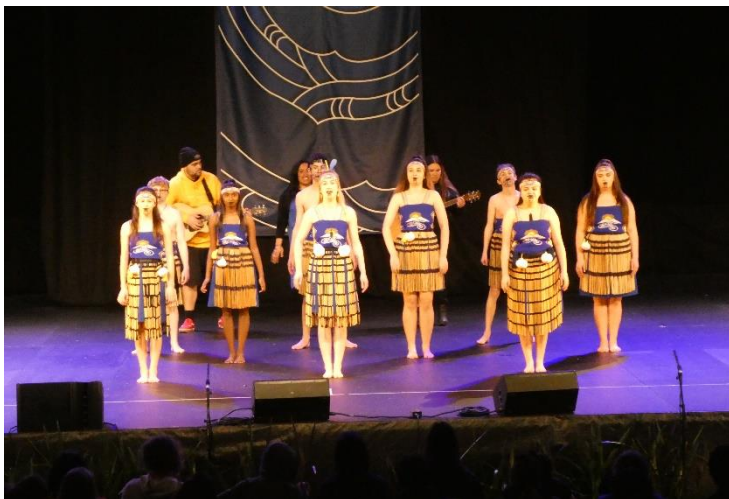
Senior Polyfest 2019