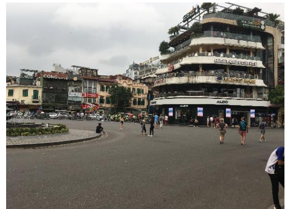
Hanoi Vietnam's capital city