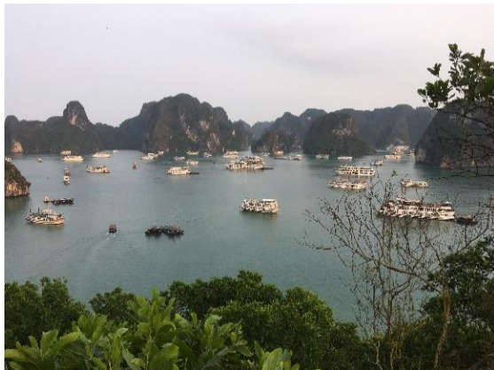
The World Heritage Halong Bay