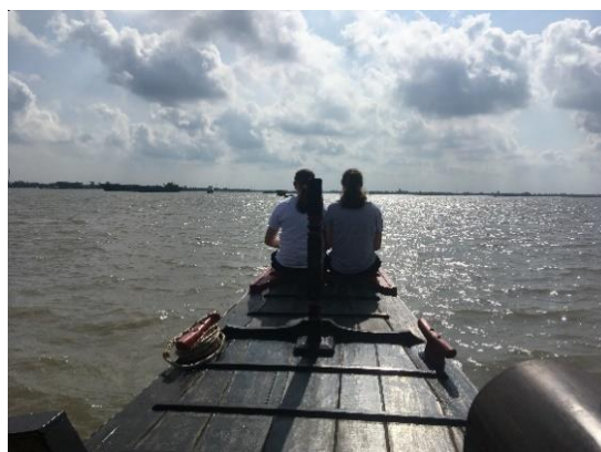
The mighty Mekong River