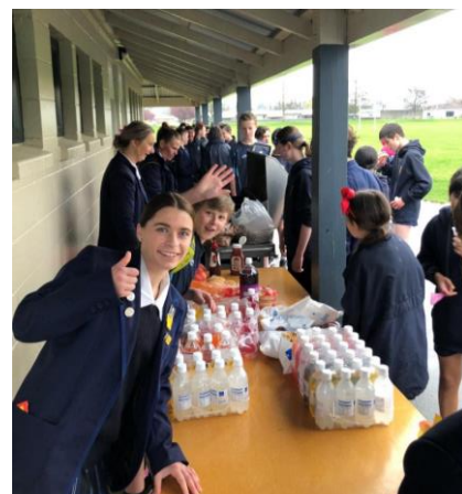
L2 SPR class

As part of our Year 12 Sport and Recreation class, we had to plan a turbo touch tournament for the Year 8 students on Tuesday 22 nd September. The event was a real success, with Year 8 students competing for their form classes in one of 3 divisions; Premiership, Championship and Social. Music and games ran throughout the day and a free BBQ kept all the students nourished. The competition was hard fought, with 8WO winning the Premiership grade, 8PH winning the Championship grade and 8KJ winning the Social grade. A big thank you to Mosgiel New World and The Warehouse for contributing to the event!