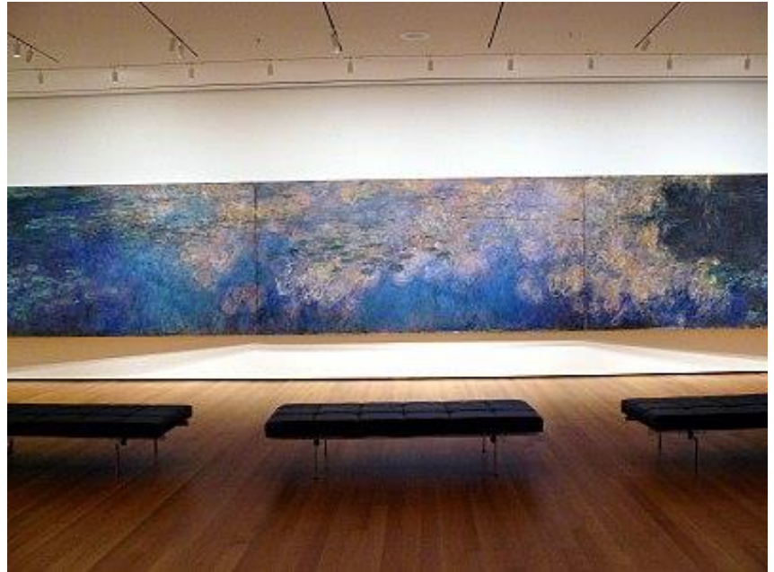
His work in the Museum of Modern Art, New York City

These images are by the current Year 9 Art Class and are inspired by his water lilies series.