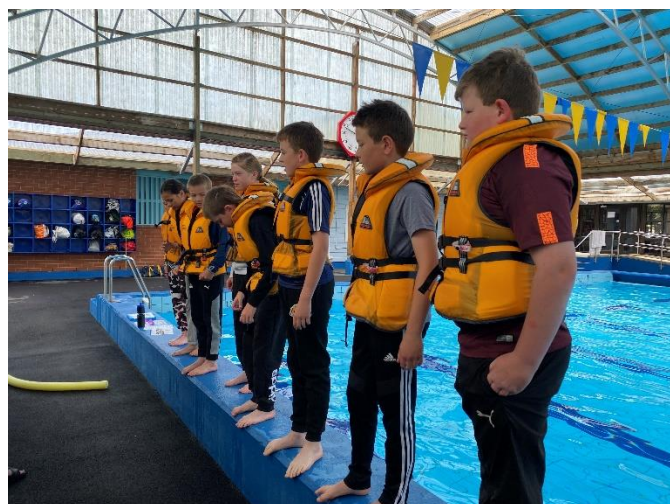
Just Swim Lessons Year 7