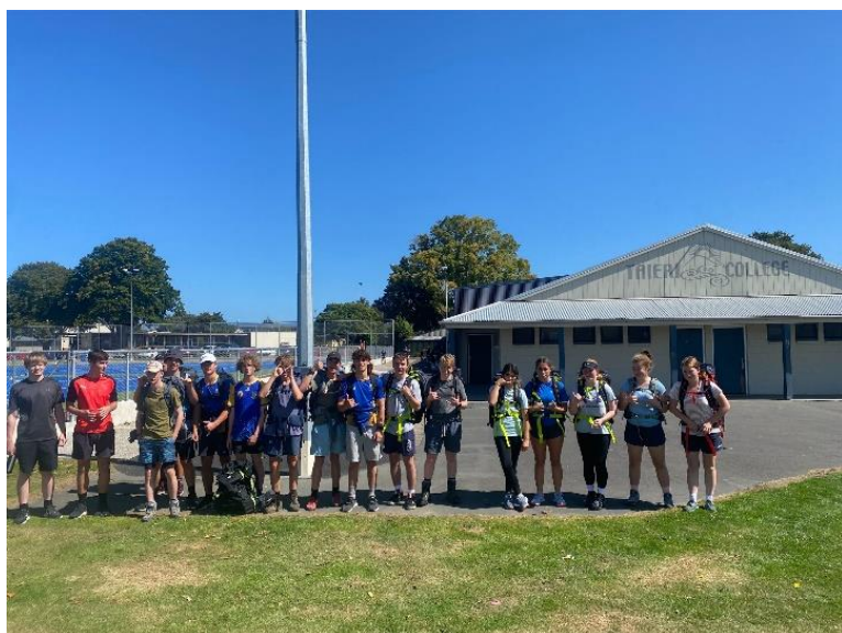
L2 SPR Practice Walk for Kepler Expedition