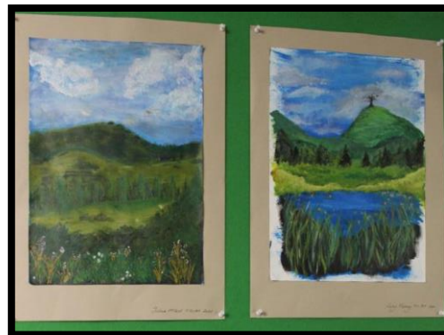
Year 10 Artwork